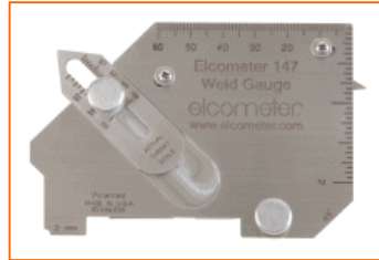
Elcometer 147 Weld Gauge: Side 1